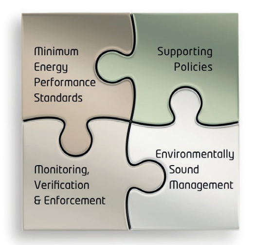
Figure 1: Integrated policy approach for a rapid transition to efficient lighting

To address these issues and guarantee a sustainable transition to efficient lighting, UNEP recommends an integrated policy approach, based on the publication, Achieving the Global Transition to Energy Efficient Lighting Toolkit <sup>27</sup>. This approach emerged from a global dialogue facilitated by UNEP and 40 institutions from governments, international organizations, private sector, and civil society groups from developing and developed countries, to elicit successful lessons learned in implementing efficient lighting programmes. It highlights the importance of a multi-stakeholder consensus, incorporating the needs and priorities of the public and private sectors, non-governmental organizations, civil society, and funders. The integrated policy approach has four elements, as described below.