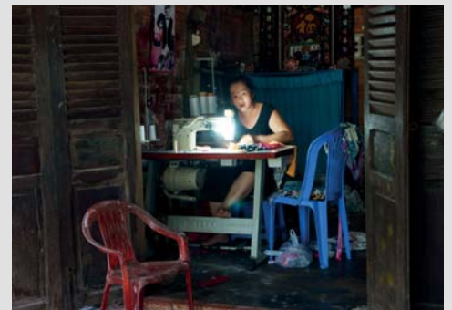
Reduce electricity bills every month