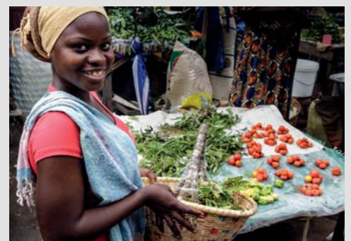
Increase purchasing power in developing countries