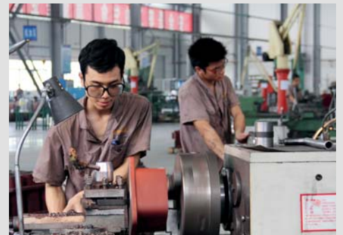
Improve business opportunities and create new jobs